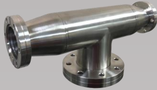
Extorr P/N – MAN450C