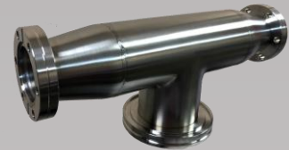
Extorr P/N – MAN63S

Description: XT Series Probe Manifolds are high conductance vacuum tees for connecting a gas inlet valve and an Extorr quadrupole probe to a high vacuum pump. The manifolds maintain a high pumping speed to the RGA for less background gas interference. All manifolds are made from 304 stainless steel and have 2 x 2.75-inch (DN 40 CF) ConFlat (CF) flanges for the RGA Probe and inlet. XT Probe Manifold pump flanges are available to fit most turbomolecular vacuum pumps. Stainless steel mounting hardware and copper gaskets for the CF flanges are included with the XT Probe Manifold.