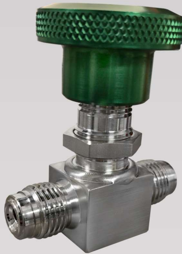
XT Swagelok Bellows-Sealed Valve with VCR Fittings

Valve Description: Valve for use with Extorr vacuum parts and in other vacuum systems and applications.