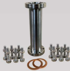
N700 with mounting hardware