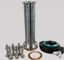
AD275C40K7L175 with mounting hardware

Nipple Description: Vacuum nipples reduce the insertion length of the Extorr RGA probe. All nipples are made from 304 stainless steel and have DN 40 CF, 2.75 inch ConFlat (CF) flanges at both ends. Nipples come in 7.50 inch OAL, 5.50 inch OAL, and 2.50 inch OAL options. Stainless steel mounting hardware and copper gaskets are included.