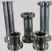
(back row from left to right) AD275C40K7L175, N500, N700